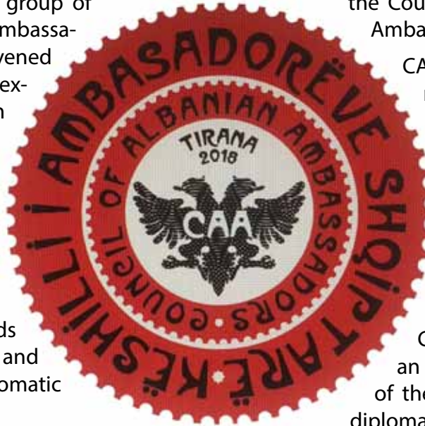
Logo of CAA

and high ranking career diplomats who compose the General Assembly of the Council of Albanian Ambassadors.